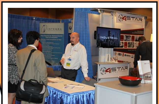
Reconnect with Suppliers and Colleagues

Meet the 2015 ERAI Conference Sponsors and Exhibitors at our Meet and Greet Exhibitor Crawl the evening of Tuesday, April 21 starting at 6:00 pm. Help us kick off the conference and enjoy drinks and appetizers provided by the exhibitors in Indigo Ballroom C.