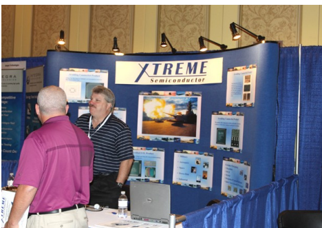
Discover New Solutions