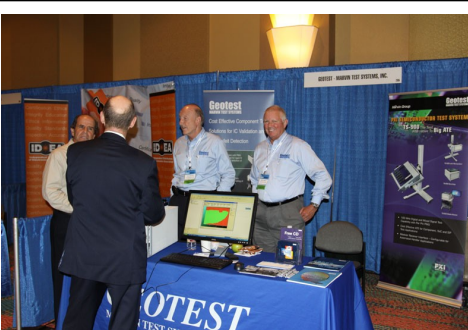
View Product Demonstrations