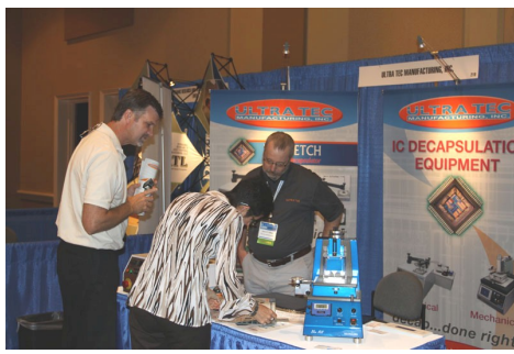
Gather Information and Ask Questions