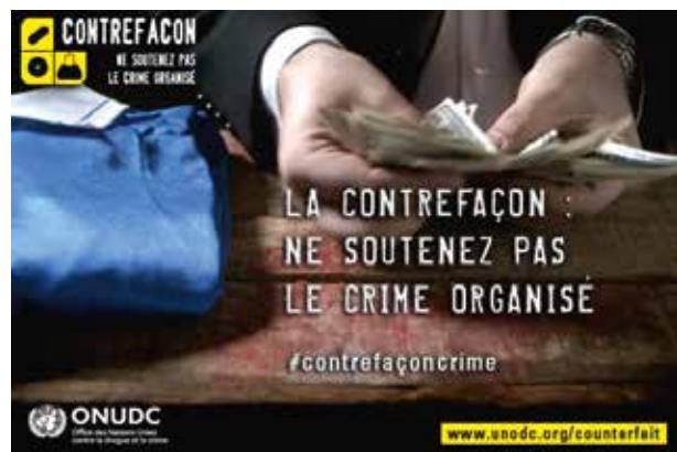
Campaign UNODC, "Counterfeit: don't buy into organized crime", See: http://www.unodc.org/counterfeit/fr/index.html