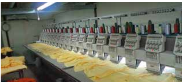
Counterfeit production facilities in Ho Chi Minh (Vietnam)