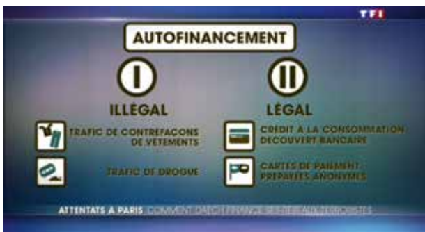
Attacks in Paris: How does Daesh finance its terrorist networks? Television news TF1 - 23 november 2015

Indeed, among the methods used by Daesh to finance its terrorist networks, counterfeiting, particularly clothes, hold a dominant position.