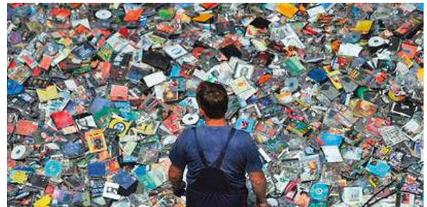
The piracy of DVD finances terrorism. Le Temps . See http://letemps.ch/Page/Uuid/d74e1a92-1ca4-11de-ad82-

Researchers of the RAND Corporation 25 also highlighted the links between piracy and terrorism. In their opinion, terrorist groups have hence decided to diversify their funding sources and adopt methods of organised crime by choosing film piracy.