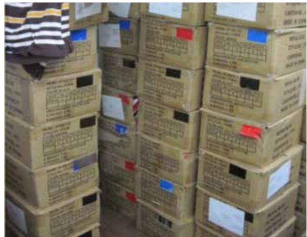
New-York- 2013- Seizure of a hundred of pants of different brands

Counterfeiters adapt the modus operandi and the shipment routes to every product and national legislations 93 .