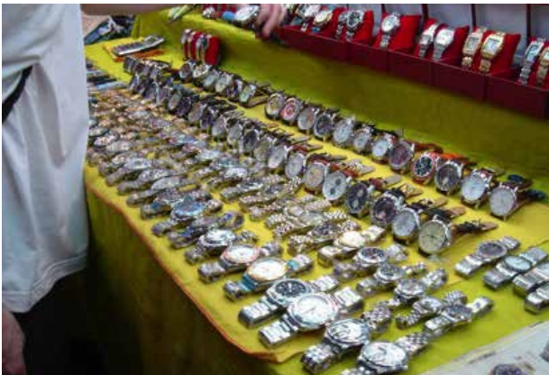
Counterfeit Market in Thailand, See: http://forum.horlogerie-suisse.com/viewtopic.php?t=3050

The counterfeiter therefore aims to create confusion between the original product and the counterfeit product, in order to benefit from another’s reputation or the result of investments made by the true holder of an intellectual property right. From a legal viewpoint, digital piracy (music, film, software, book, graphic) is therefore a form of counterfeiting, as is the production of fake brand items.